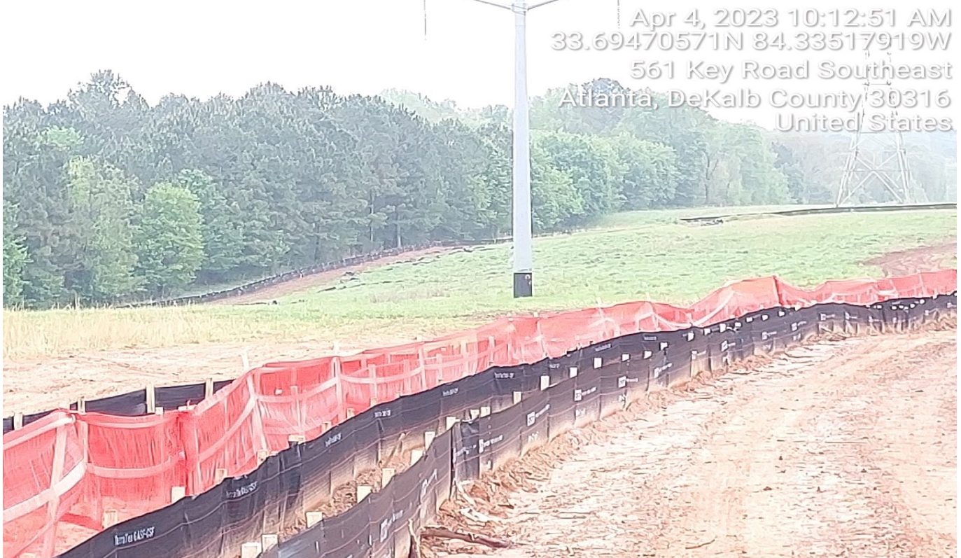
Previously Destroyed Perimeter Silt Fence at Power Easement Area