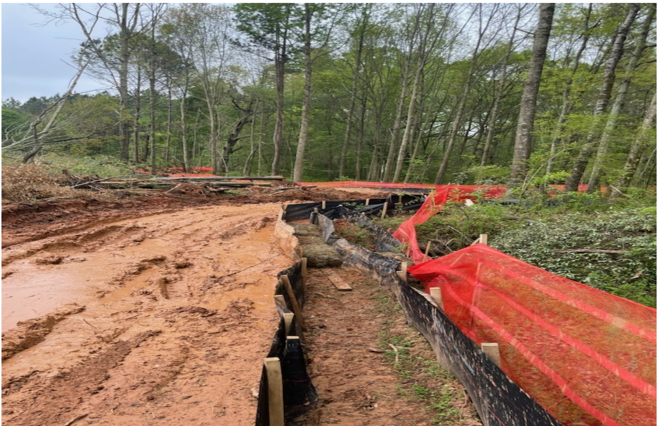
Silt fence repaired where fallen tree damage took place; Hay bales and an extra row of silt fence was added for additional stabilization