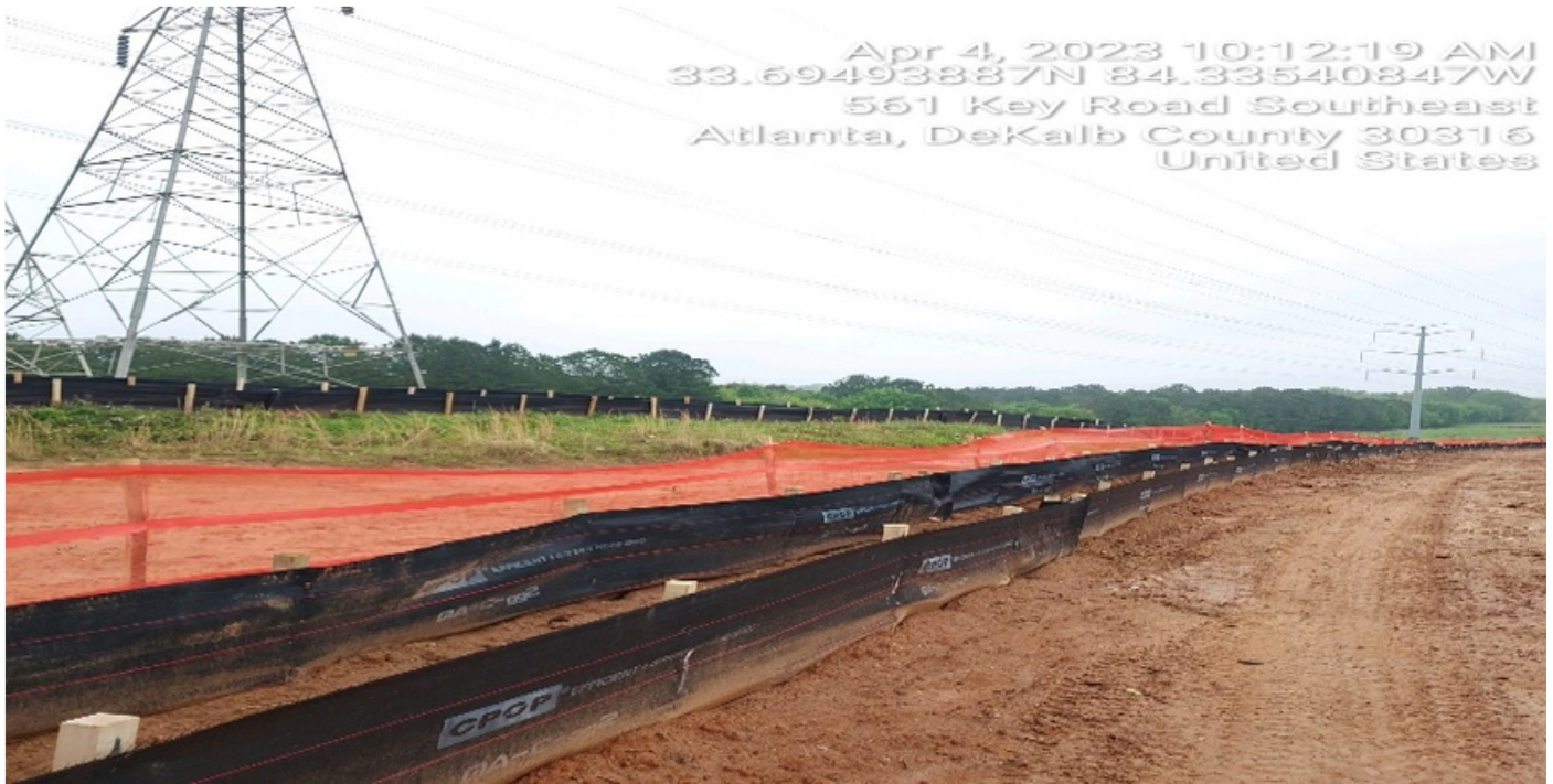
Previously Damaged Perimeter Silt Fence Power Easement – 1350 Constitution/561 Key