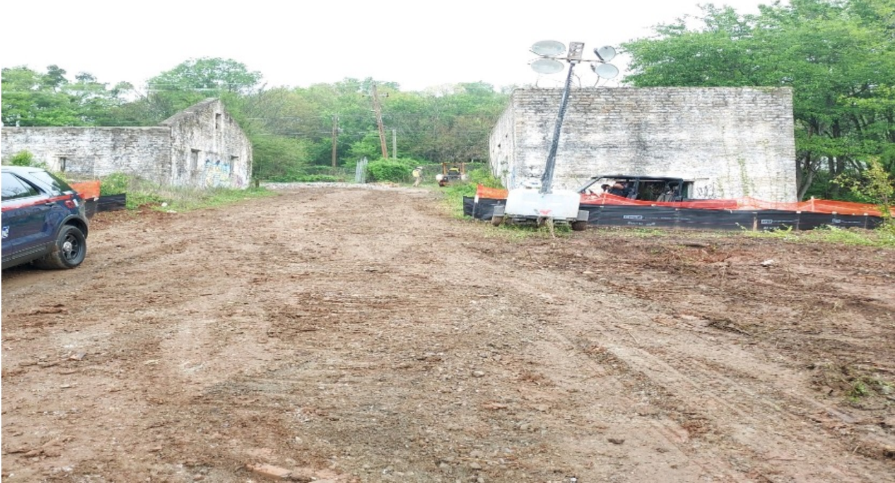
ENTRANCE on KEY ROAD (33.69685841N 84.33796873W)

Apr 4, 2023 10:43:39 AM 33.69685841N 84.33796873W 1300 Key Road Southeast Atlanta, DeKalb County 30316 United States